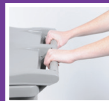
Durable and strong handles