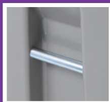
Metal lift bar