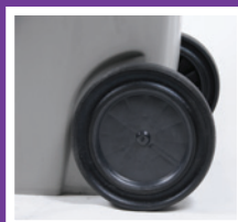
12" rubber wheels